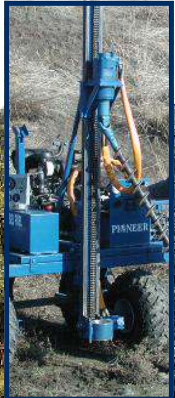
Specialty & Multi-Purpose