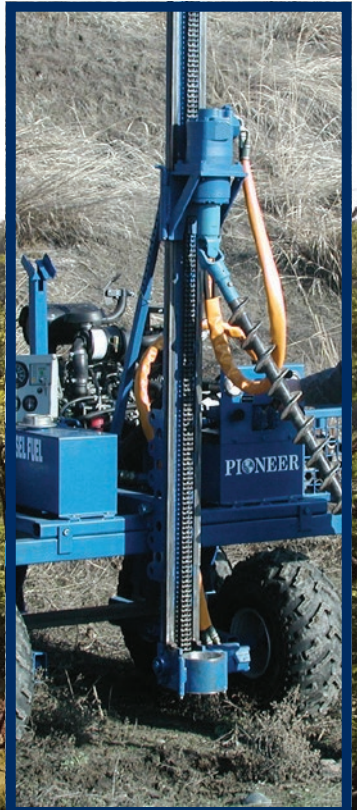
Specialty & Multi-Purpose